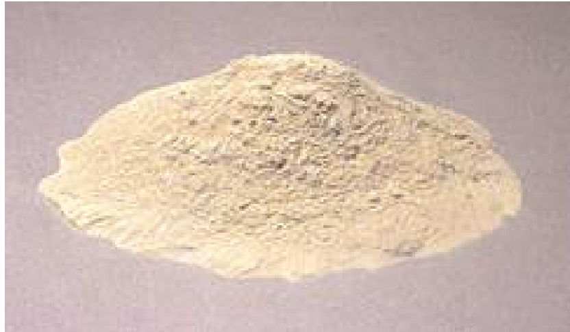
Figure- Example of fly ash