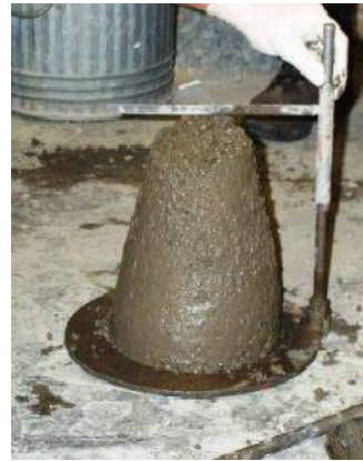
Fig4.2. Measuring Slump Fall