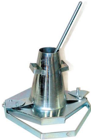
Fig.4.1 Slump Cone Apparatus